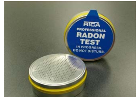
RTCA Charcoal Canister used for real estate radon test

RTCA is not able to provide results the same day with the liquid scintillation vials, because when the vials are returned to the